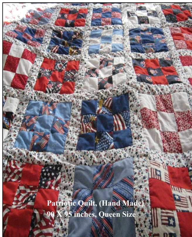
Patriotic Quilt, (Hand Made) 90 X 95 inches, Queen Size

If the enemy has done nothing for the past half hour while you dig in, it's probably because they've been in the tree line right behind you the whole time. ☺